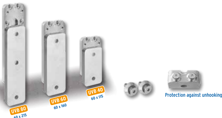
Protection against unhooking